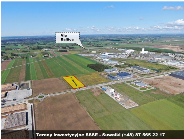
Tereny inwestycyjne SSSE - Suwałki (+48) 87 565 22 17