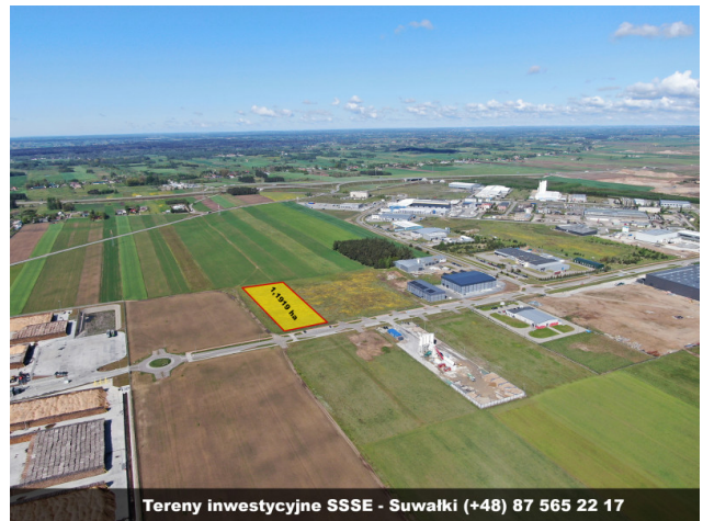
Tereny inwestycyjne SSSE - Suwałki (+48) 87 565 22 17